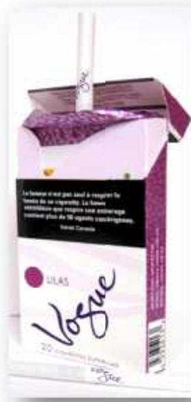
Imperial Tobacco Canada Vogue Superslims

The packaging communicates many messages about the product inside and about smoking in general, both of which influence decisions about which brand to buy and indeed whether to smoke at all. For example, packs have been specifically designed to target weight-conscious young women (see Imperial Tobacco Canada’s Vogue Superslims pack below left) and image-conscious young men (see Rothman, Benson & Hedges’ Rooftop brand [the global Marlboro brand as sold in Canada] 2010 Performance Edition pack below right that sounds like a lighter when opened).