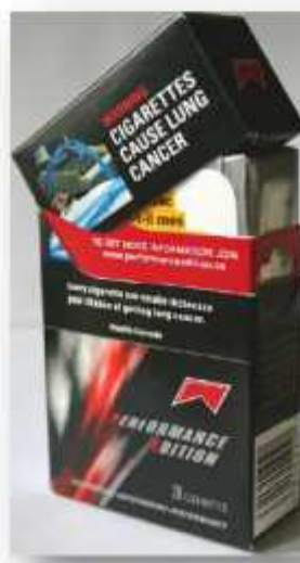
Rothmans, Benson & Hedges Rooftop, Performance Edition