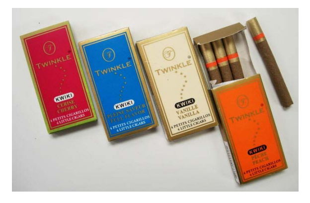
Twinkle cigarillos are available in kiddy packs of four and come in cherry, vanilla and peach as well as unflavoured.

Currently the federal Tobacco Act sets out various requirements and prohibitions for tobacco products, including cigarillos.