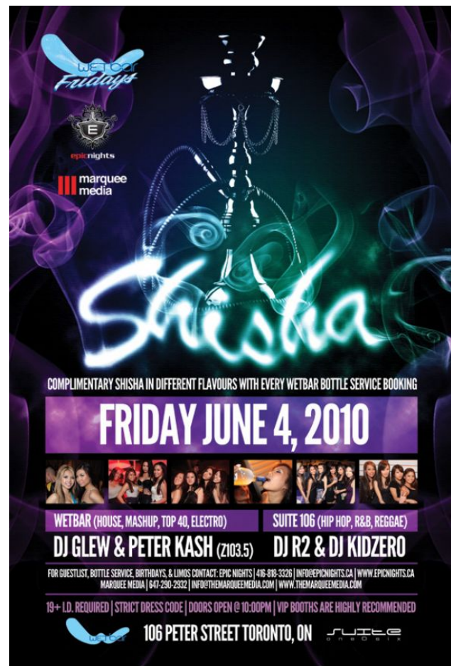
A hookah bar advertisement, Toronto, 2010

The Smoke-Free Ontario Act (SFOA) pertains only to tobacco—currently the smoking of other weeds or substances is beyond its jurisdiction. It is increasingly common at hookah bars for proprietors to remove tobacco shisha from its original packaging and store it in unlabelled plastic containers. 45