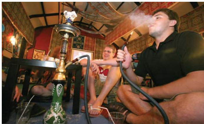
Young adults socializing and sharing a hookah pipe

It is not easy to smoke a waterpipe quickly. Indeed, part of the attraction of smoking a hookah is the opportunity to gather with friends and socialize. In these circumstances, it is common for people to smoke for an hour or longer, passing the hose(s) back and forth. When asked about smoking a waterpipe versus a cigarette, young people agreed that a waterpipe offered a pleasurable experience—an opportunity to spend time and relax with friends. In contrast, these same survey respondents indicated that smoking cigarettes was considered a mundane, anxiety-relieving addiction. 28