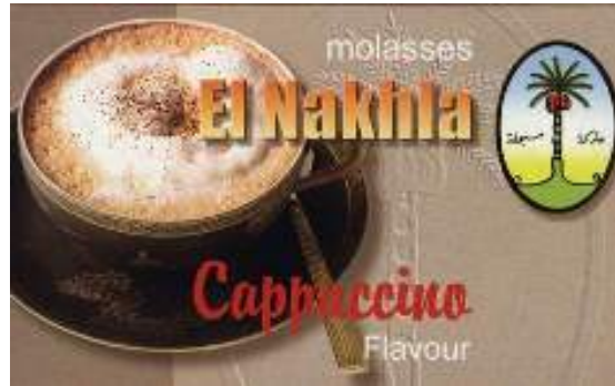
Cappuccino flavoured tobacco shisha

With fruit, candy and alcohol flavours such as grape, orange, double apple, cola, bubble gum, cappuccino, marguerita and piña colada, waterpipe smoking is rapidly gaining popularity. Shisha has a high sugar content which, when mixed with flavourings, makes the smoke extremely aromatic. Due to a lower combustion temperature and the fact that it passes through water before being inhaled, hookah smoke is both cooler and moister than cigarette smoke. The result is a smoke that both smells and tastes good and has a smoothness that is easily tolerated—masking the tobacco taste and softening the smoking experience for beginners.