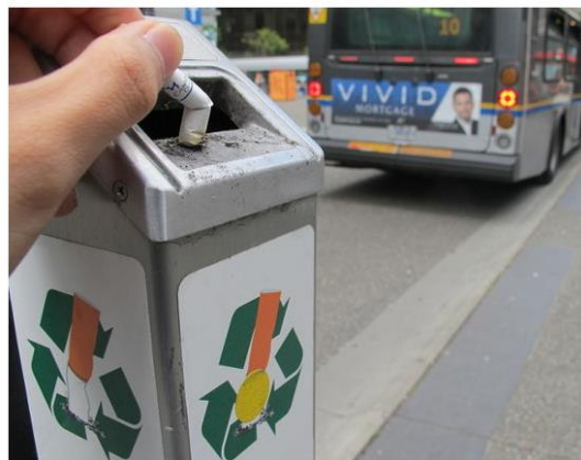
Vancouver City dropped the tobacco-industry sponsorship from its ashtray program.

New styles of CSR have recently been introduced by Imperial Tobacco. In 2012 it partnered with the American commercial recycling firm TerraCycle on a program to place ashtrays on city streets. 115 The City of Vancouver agreed to partner with the program in November 2013, failing to acknowledge when it did so that the program was underwritten by Imperial Tobacco. 116 Following objections from the health community, including the city’s Medical Officer of Health, the City distanced itself from Imperial Tobacco’s sponsorship. 117